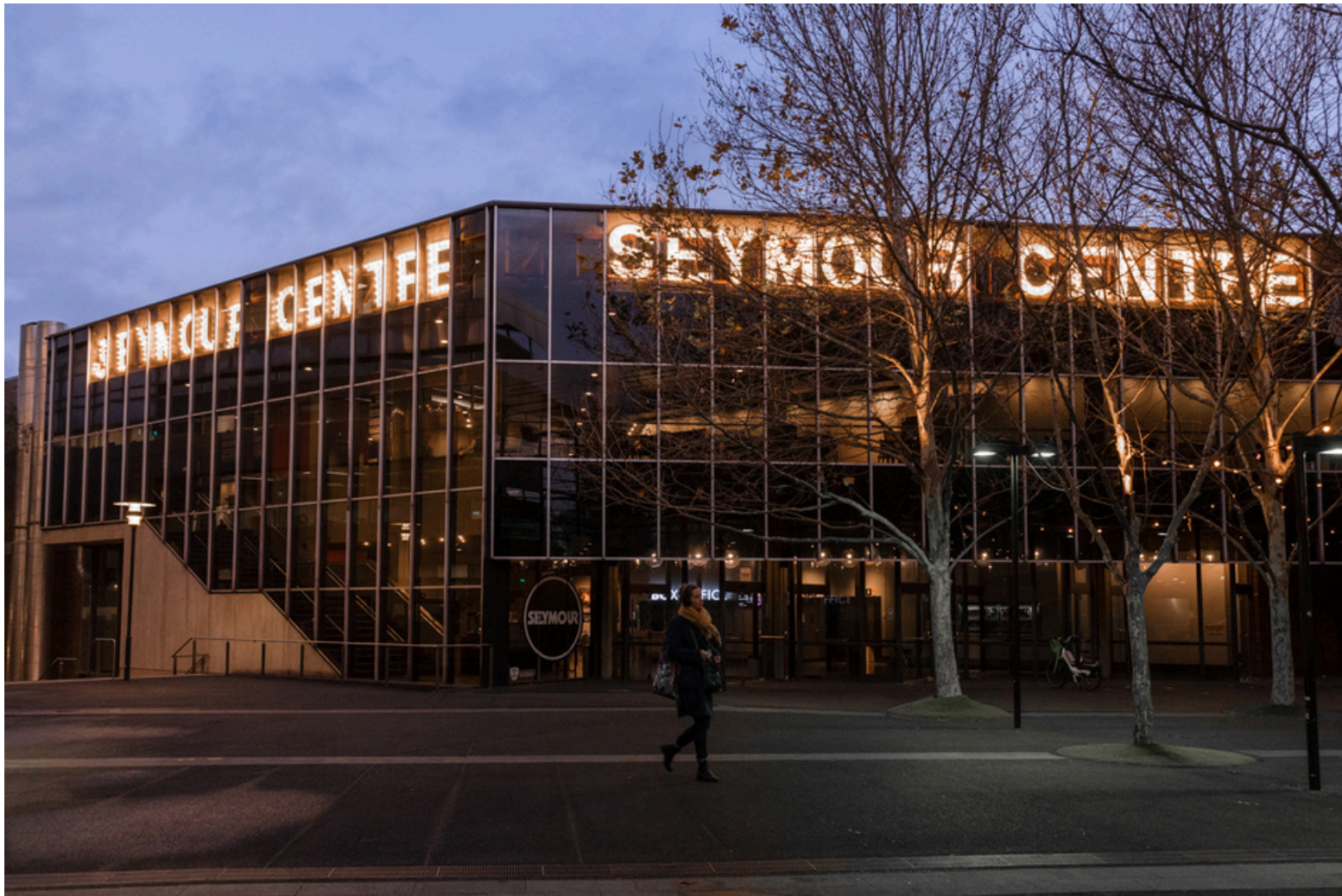
This building is the Seymour Centre